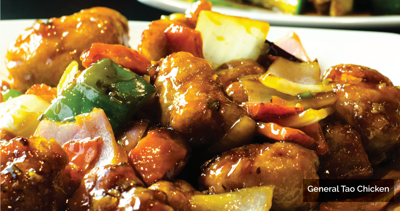
General Tao Chicken