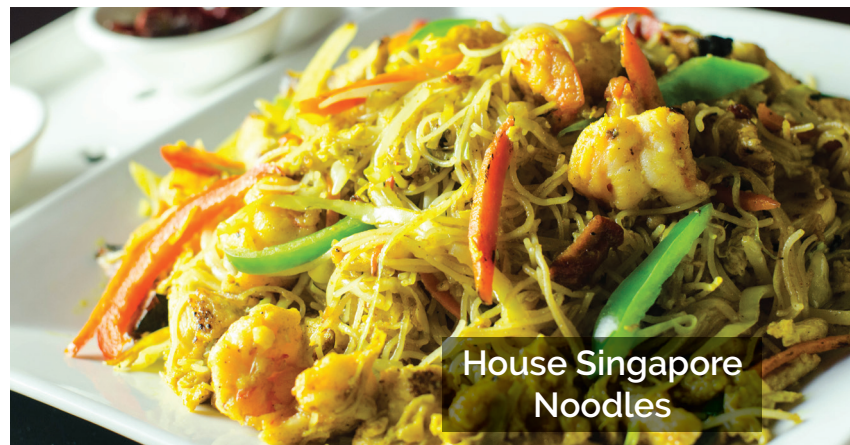
House Singapore Noodles