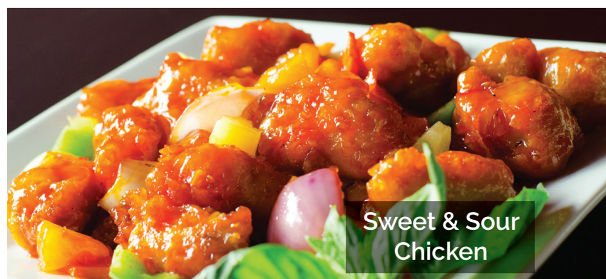
Sweet & Sour Chicken