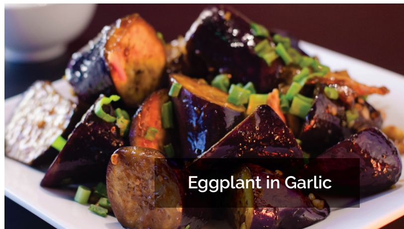
Eggplant in Garlic

green peppers and onions in a spicy honey sauce