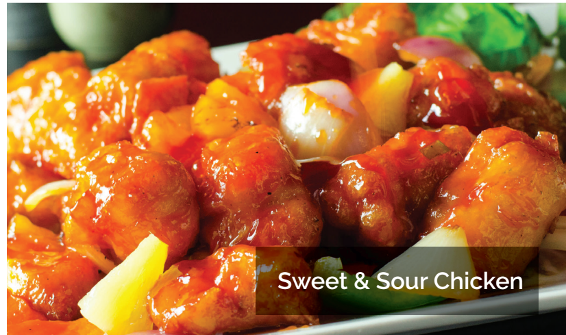
Sweet & Sour Chicken