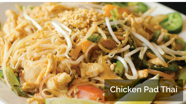
Chicken Pad Thai